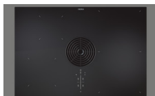
40.002.759.00 / CHF 3068.- BORA M Pure PURMA