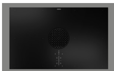
40.002.956.00 / CHF 3759.- BORA X Pure PUXU2