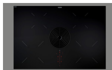
40.002.065.00 / CHF 2713.- BORA Pure PURA