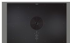
40.002.760.00 / CHF 3234.- BORA M Pure PURMU