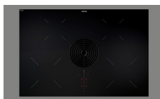
40.002.066.00 / CHF 2879.- BORA Pure PURU