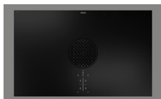
40.002.955.00 / CHF 3593.- BORA X Pure PUXA2