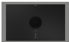
40.002.958.00 / CHF 3985.- BORA X Pure Rough PUXU2R

You can find additional articles here > Weblink