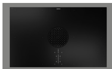
40.002.956.00 / CHF 3759.- BORA X Pure PUXU2