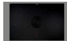
40.002.065.00 / CHF 2713.- BORA Pure PURA