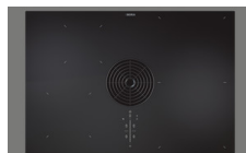
40.002.759.00 / CHF 3068.- BORA M Pure PURMA