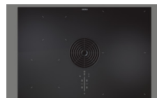
40.002.760.00 / CHF 3234.- BORA M Pure PURMU