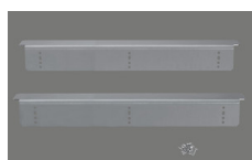
500.000.074.00 / CHF 60.- Set of support brackets