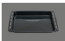
500.000.115.00 / CHF 96.- Extra deep baking sheet 50 mm