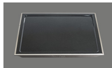
500.000.114.00 / CHF 135.- Cooking chamber divider