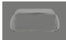
500.000.117.00 / CHF 117.- Glass bowl (lid for cooking container)