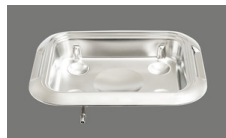
500.000.116.00 / CHF 123.- Cooking container