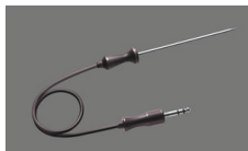
500.000.048.00 / CHF 93.- Core temperature sensor