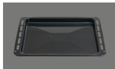
500.000.112.00 / CHF 82.- Multi-purpose baking sheet 30 mm

You can find the complete range of accessories here > Weblink