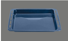
500.000.040.00 / CHF 88.- Extra deep baking sheet 50 mm