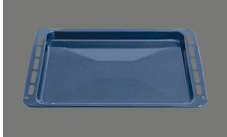
500.000.039.00 / CHF 75.- Multi-purpose baking sheet 30 mm

You can find the complete range of accessories here > Weblink