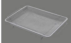
500.000.174.00 / CHF 99.- Air Fry Tray