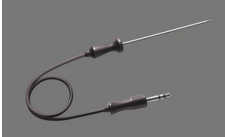
500.000.173.00 / CHF 93.- Core temperature sensor