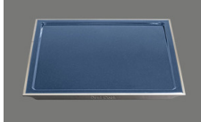
500.000.046.00 / CHF 123.- Cooking chamber divider