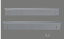
500.000.074.00 / CHF 60.- Set of support brackets