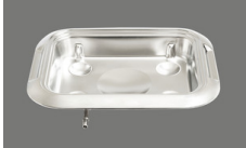
500.000.116.00 / CHF 123.- Cooking container